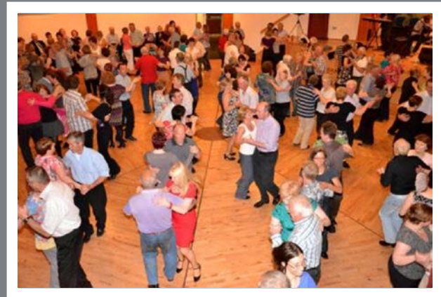
Céilí faoi seoil ag an bhFleadh Nua anuraidh.

Top class CÉILITHE are a cornerstone of the programme at any Fleadh Nua and this year's lineup is: